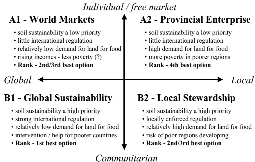
Figure 2 Summary of likely impacts on soil sustainability of the story-lines used in developing the IPCC emission scenarios.

recent trends, the future will probably most closely resemble a combination of the Global Market and Global Sustainability scenarios. In order to cope with the uncertainty inherent when planning for the future, soil management strategies should be developed which are beneficial now, and which are predicted to also be beneficial in the future.